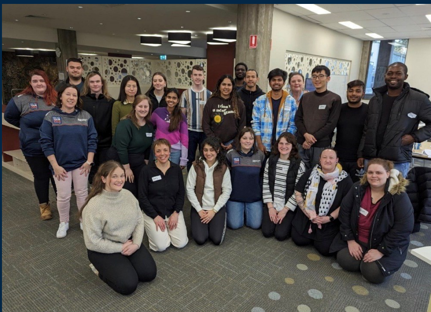
Student Leadership Retreat

THIS YEAR SENATE HAS MADE THEMSELVES KNOWN THAT THEY ARE FULL SWING SINCE COVID BY RUNNING A LEADERSHIP RETREAT AS WELL AS IDENTIFYING THEMSELVES WITH NEW HOODIES. SENATE HAVE PASSED MANY MOTIONS THIS YEAR THAT WILL BENEFIT FUTURE AND CURRENT STUDENTS. NOT MANY PEOPLE ON CAMPUS KNOW WHO THE SENATE IS BUT WE ARE SLOWLY GETTING OUT THERE. 2024 HAS SOME EXCITING THINGS PLANNED AND SENATE CAN'T WAIT TO CONTINUE ON WITH CREATING POSITIVE AND MEANINGFUL CHANGE TO MAKE OUR UNIVERSITY MORE ENJOYABLE.