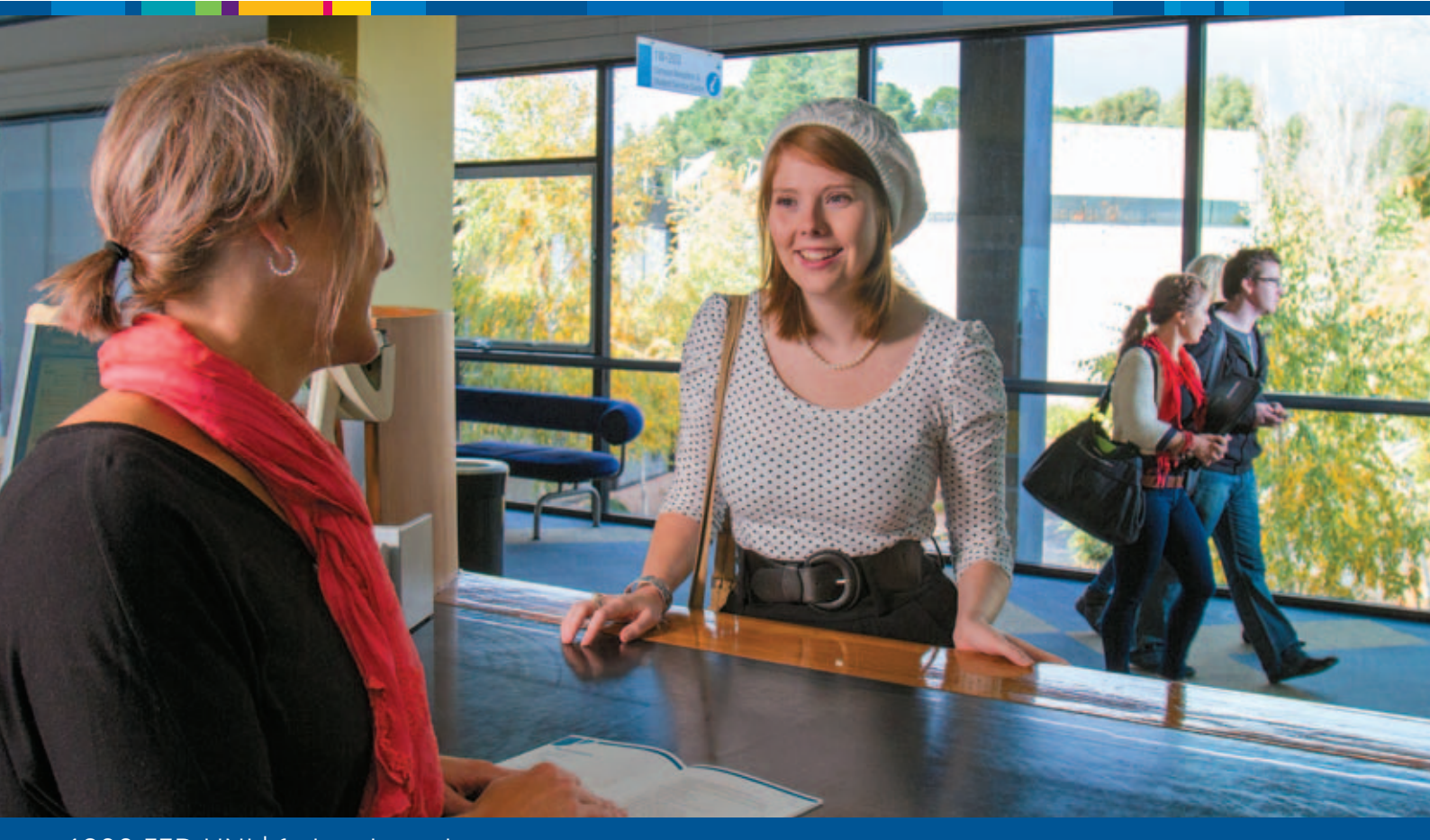
1800 FED UNI | federation.edu.au