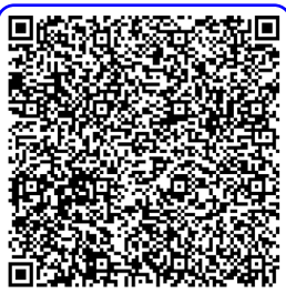
Directions to campus

* If you're a domestic student, you can enjoy some free time during these sessions.