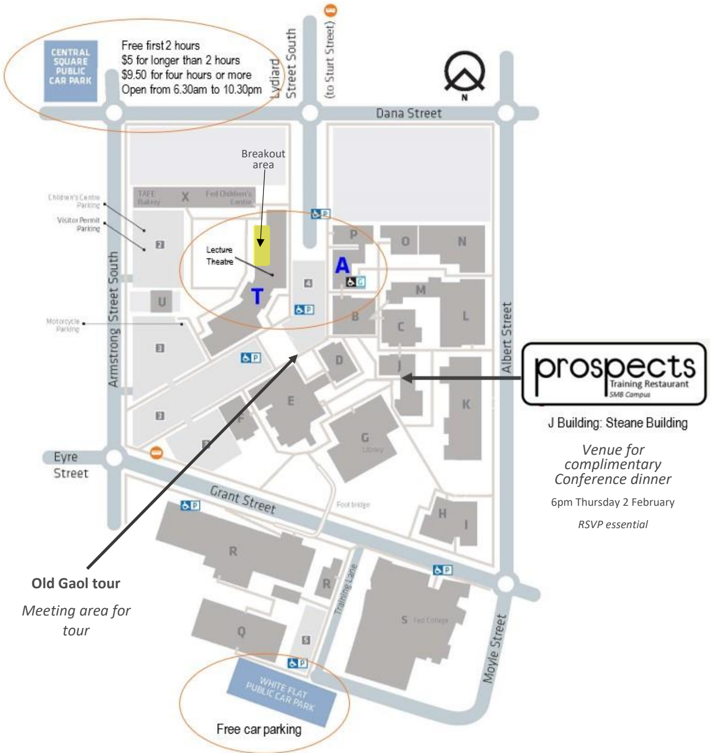
SMB Campus, Ballarat