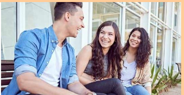
* 2017 Employer Satisfaction Survey; ^ 2017 Victorian Institution Survey: Australian Federal Government's Quality Indicators Learning & Teaching (QILT) qilt.edu.au.