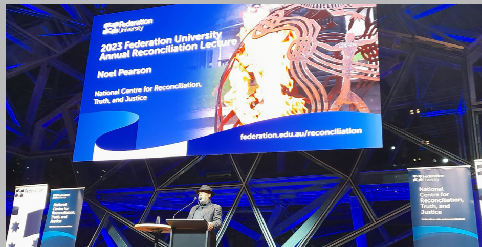
Noel Pearson delivering the inaugural Federation University Annual Reconciliation Lecture.