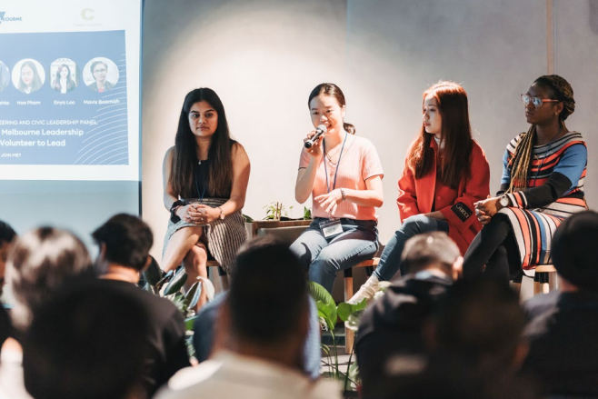
Leadership Labs Volunteer to Lead Weekend