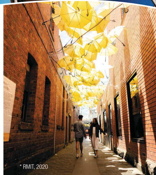
* RMIT, 2020

If you're searching for a regional university with outstanding value, you've found us.