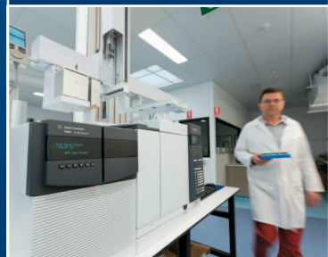
High sensitivity GC QQQ MS