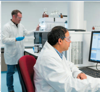
High resolution QTOF MS