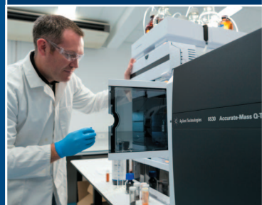
LC-QTOF system with UHPLC