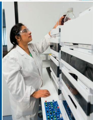
Multi detector Bio-inert HPLC

The CTRC have been recently awarded (April 2015) a Victorian government grant to investigate upgrading coal based liquid fertiliser products for Omnia Specialities (Pty Ltd). This continues our long association with local industries in value adding to coal products.