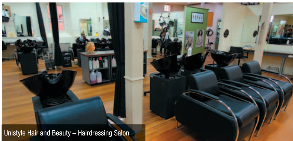
Unistyle Hair and Beauty – Hairdressing Salon