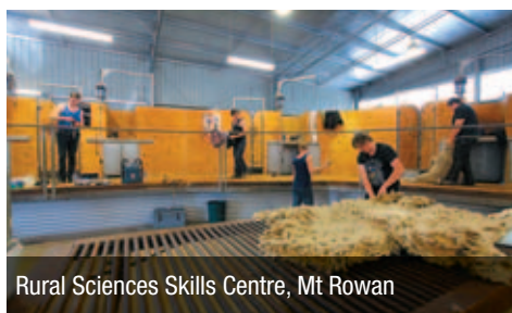
Rural Sciences Skills Centre, Mt Rowan