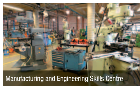
Manufacturing and Engineering Skills Centre

While many of our TAFE programs run alongside higher education programs at our Mt Helen and Camp Street campuses, we are also home to some of the best TAFE dedicated facilities in Victoria.