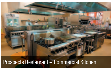
Prospects Restaurant – Commercial Kitchen